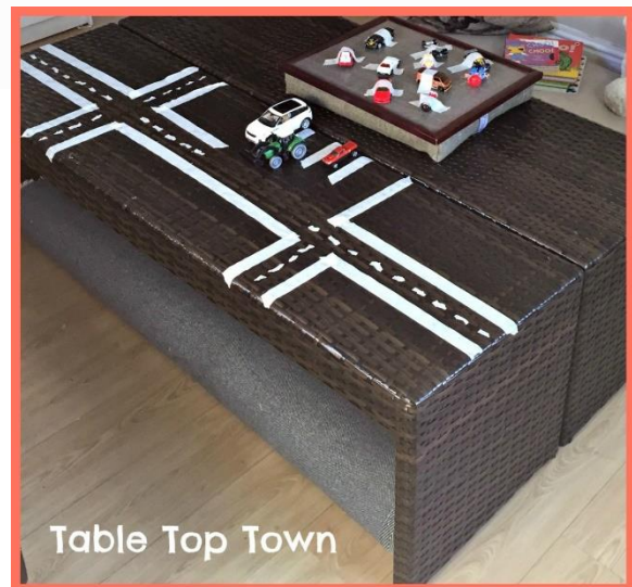
Table Top Town

Use masking tape to make a track for your cars on the floor or on a table. If you've got chalk, you could draw a track on the floor outside.